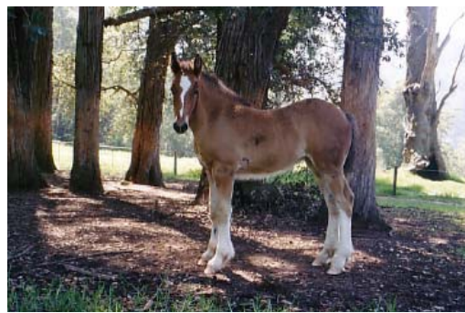
Cedars Aspen Louise Sire: 'Cedars Majestic' - Dam 'Cedars Blossum'