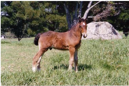
Cedars Ernest Sire: 'Cedars Majestic' - Dam 'Cedars Duchess'